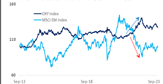
Exhibit 3: Inverse correlation of USD and MSCI EM